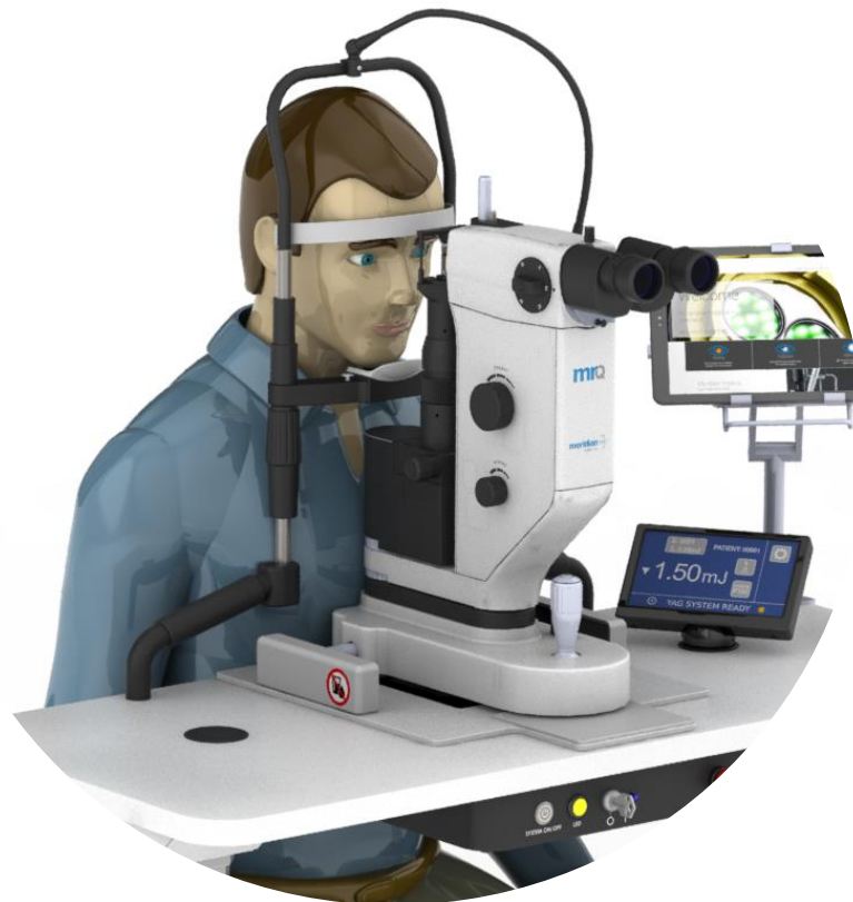
MR Q SLT ophthalmic medical device image